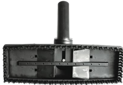
4221 – Steam nozzle with threaded end