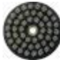
4213 - Brass steam brush Ø 53 mm