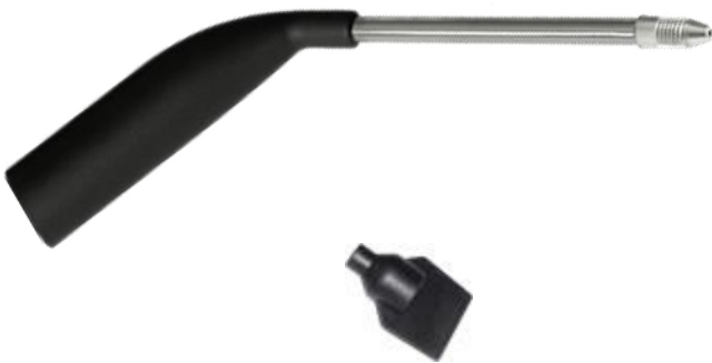
4210 - Scraper 45 mm