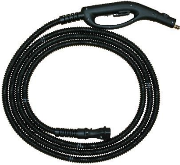
4226 – Steam / detergent handle with hose 5mt